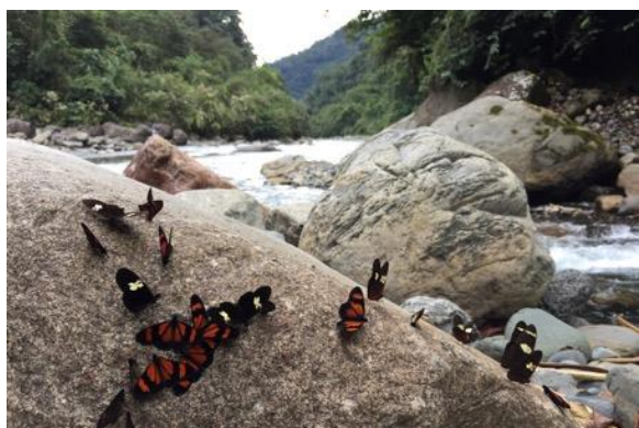
Butterflies puddle for salts and other—in this case from the expedition team's sweat—at the Rio Waysampia Chico, near base camp.